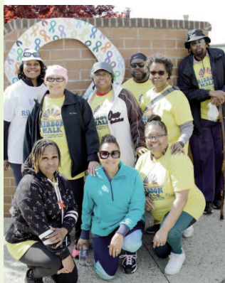
CAYACC F.I.T. Women