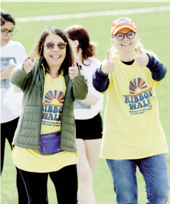
Two thumbs up for Ribbon Walk!