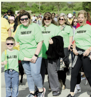
Team Parkview Oncology Navigators post for a quick photo during their walk.