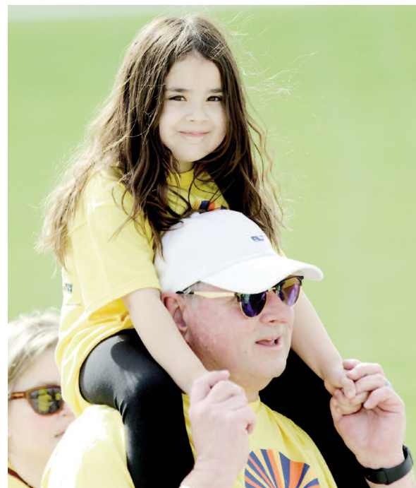
This walker got a special ride!

Our community raised $106,482 to support local people with cancer. Thank you so much to all team captains, fundraisers, donors, and sponsors for working hard to keep physical, emotional, and financial supports available through Cancer Services.